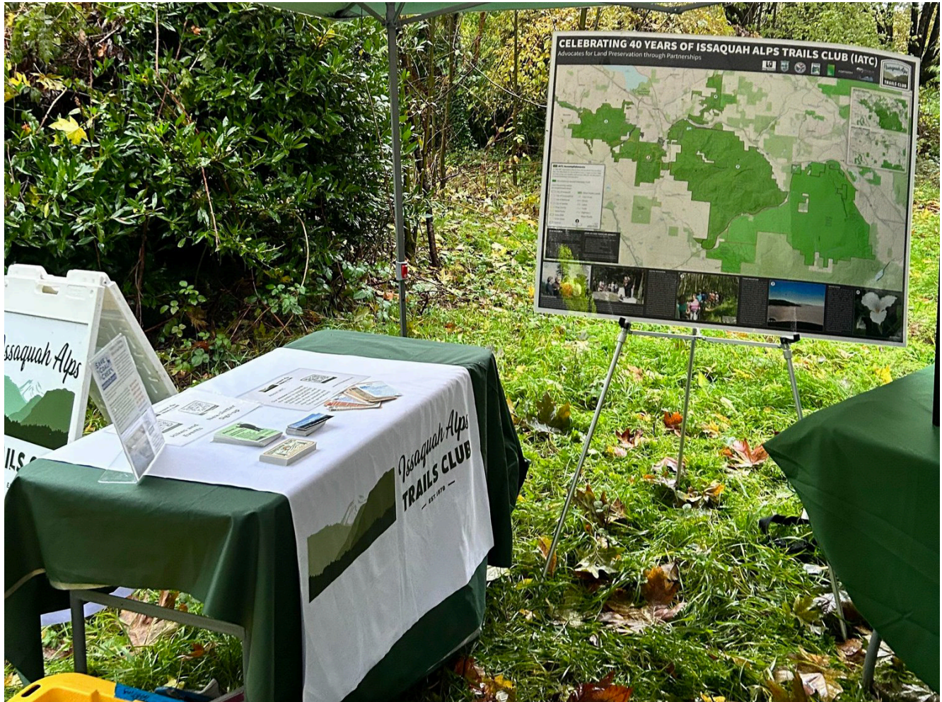
Just one of our many community engagement and education events