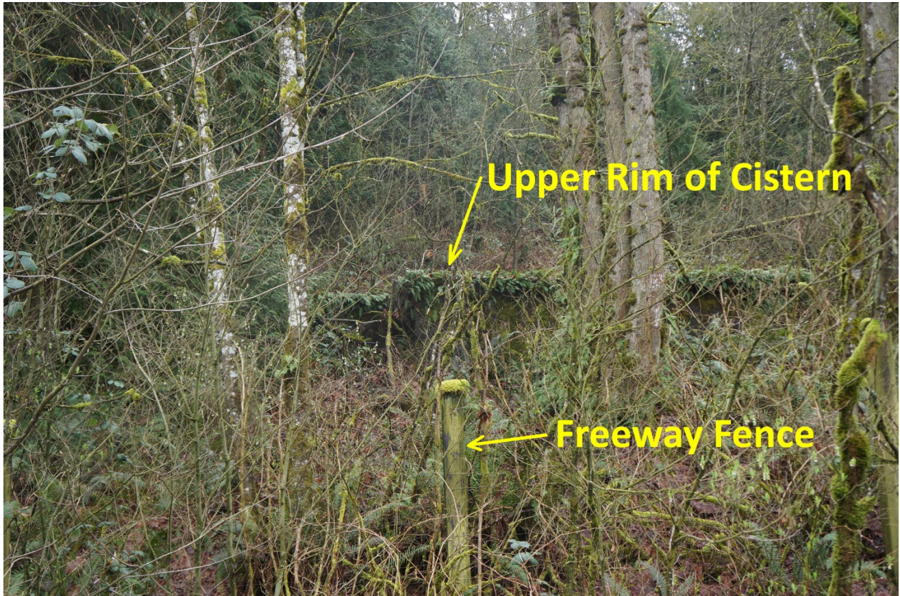
The view of the cisterns from the i-90 on-ramp (Exit 18). Note: this photo was taken in the winter; it's a little harder to see through the foliage of summer.

If you are lucky enough to have an old copy of the "Guide to Trails of Tiger Mountain" by William K. Longwell Jr., there is a specific hike description for the "Waterworks Trail," which went by these cisterns and then skirted along the base of the Tradition Plateau eastward. Sadly, it was a very soggy and difficult-to-maintain trail, so it has been allowed to return to nature.