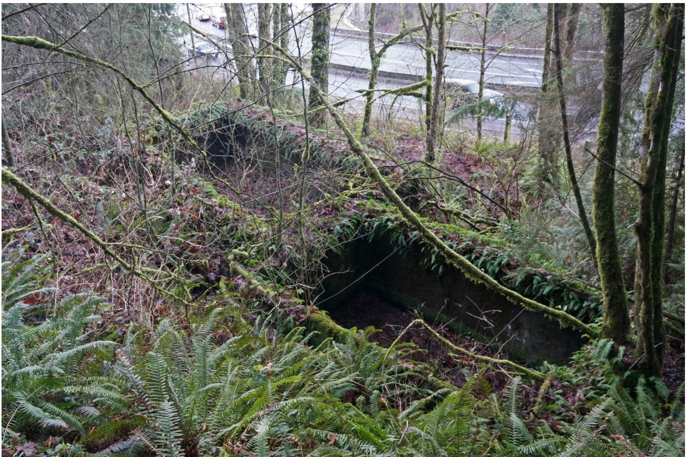
Cisterns of the old Issaquah waterworks, with I-90 in the background.

In the early days of the town, the public works department took advantage of this water resource by constructing a series of catchments, cisterns and pipes to provide water to the residents. If you know where to look, the system's remnants can still be seen. The most easily seen artifact is a pair of concrete cisterns a short distance from the I-90 exit 18 eastbound on-ramp. The photo below shows the cisterns, taken from the slope above, with the freeway in the background. They haven't been cleaned in a while!