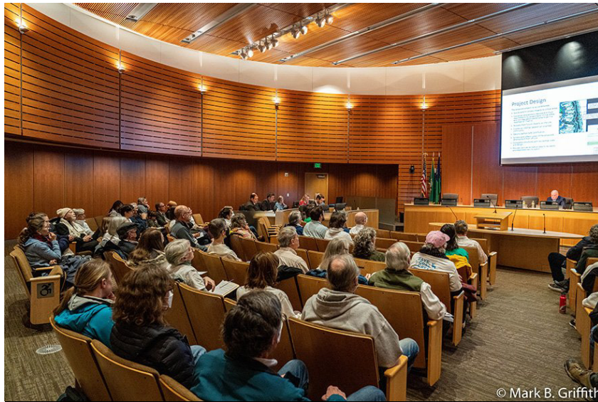
March 2nd hearing at Bellevue City Hall

Thank you to everyone who attended the March 2nd public hearing at Bellevue City Hall. It was a packed house, with supporters of Save Coal Creek attending both in person and virtually. Attendees and council members heard from many supporters, who gave thoughtful and impactful testimonies on record to support Save Coal Creek.