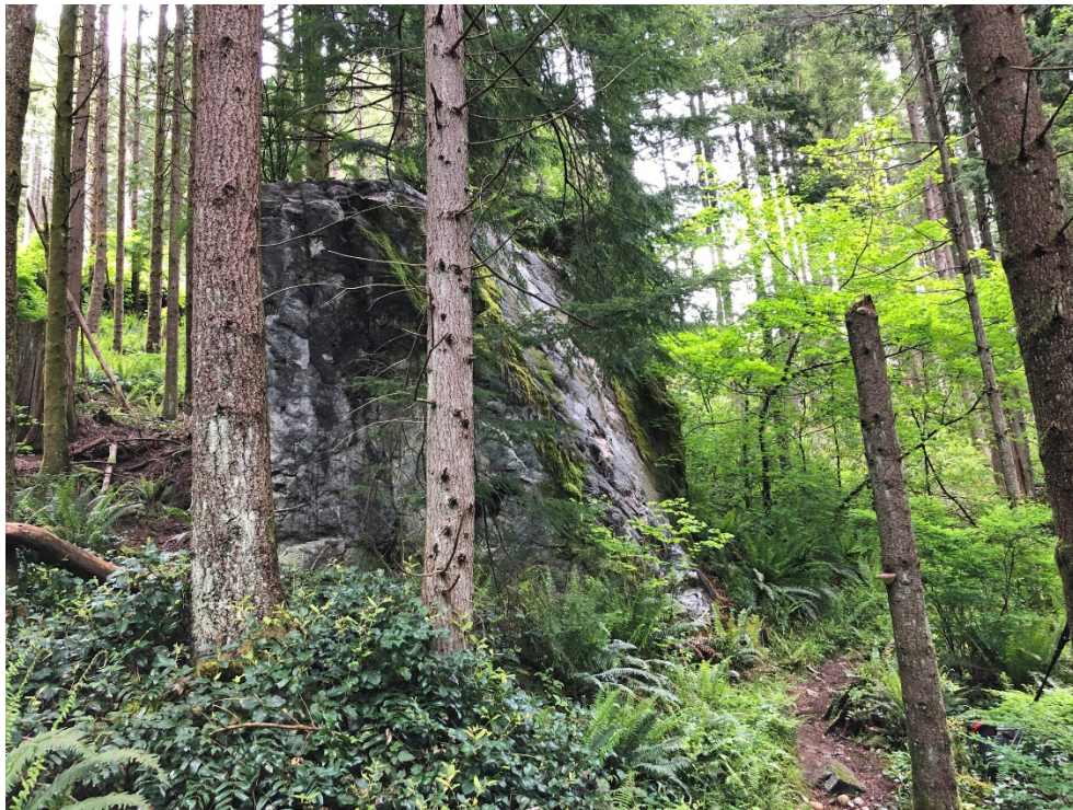
The "Lone Rock" as seen from the Tiger Mountain Trail.

I don't know how the name came to be. It's an unfortunate choice since there are at least two other features known as "Lone Rock" in Washington state alone. One in Hood Canal, and one in Chelan County along the Columbia River. To better compete with the Fantastic Erratic, maybe we should re-dub it the "Stupendous Stone" or "Bodacious Boulder." Or, more modestly, align with the nearby Fifteenmile Creek and call it the "Fifteenmile Rock." But no one is asking for my opinion on that, anyway.