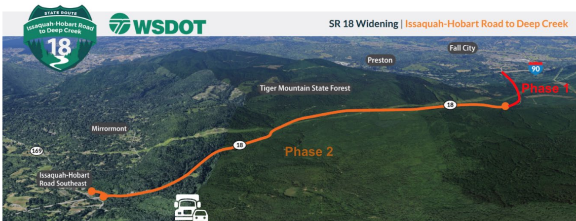
Image of SR-18 between I-90 and Issaquah Hobart Road depicting the Phases in which improvements will be completed. Phase 1 will be a new interchange between SR-18 and I-90 and is set to begin construction in 2021 with a completion date of 2023. For more information on this interchange please visit WSDOT's website: https://www.wsdot.wa.gov/Projects/I90/SR18/ICImprove/default.htm

Key changes WSDOT are considering to address these concerns include widening the road to four lanes along a 1.5 miles stretch of the highway between I-90 and Issaquah Hobart Road. Additionally, they are redesigning the interchange between SR-18 and I-90 and considering safety measures at Tiger Mountain Summit which could include medians or a "diamond interchange" to ensure the safety of eastbound turns.