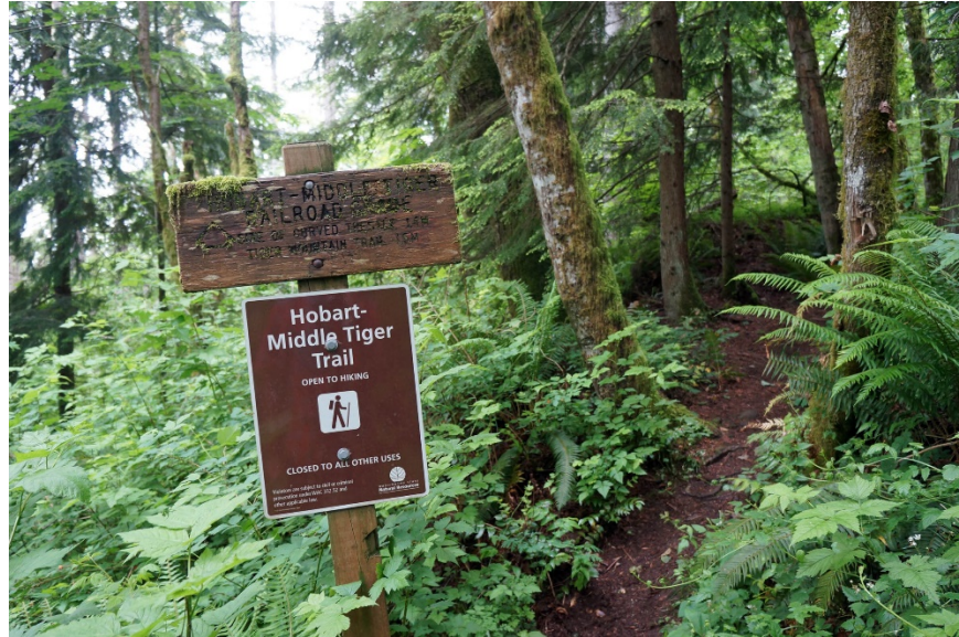
Signpost at the start of the Hobart Middle Tiger RR trail, where it intersects the Middle Tiger Trail.

Time has taken its toll, but old logging relics can still be seen along the old railroad grade. The most notable is a 2 inch steel cable used as an elevated "skyline" to skid logs out of the forest to a landing where they would be loaded on a railroad car. The cable is intact for at least a half mile, showing itself in several places along the trail. Watch for it.