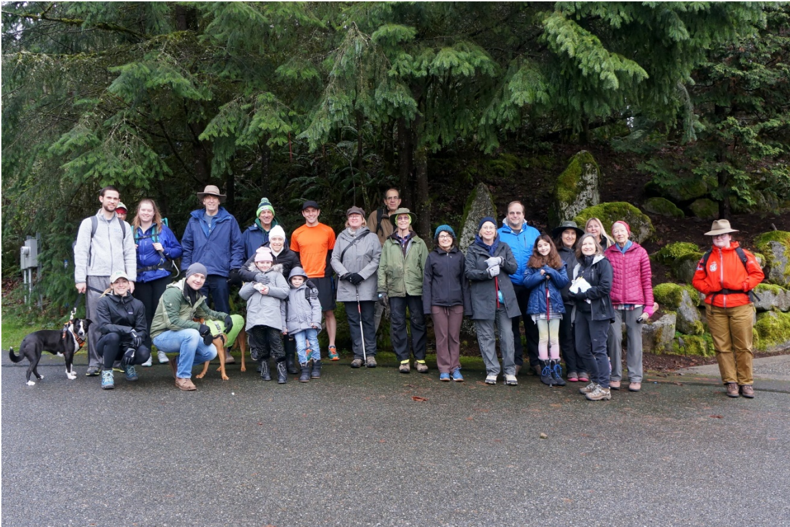
Photo of DeLeo Wall hike participants