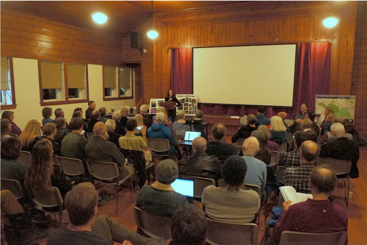
Nearly every seat was taken