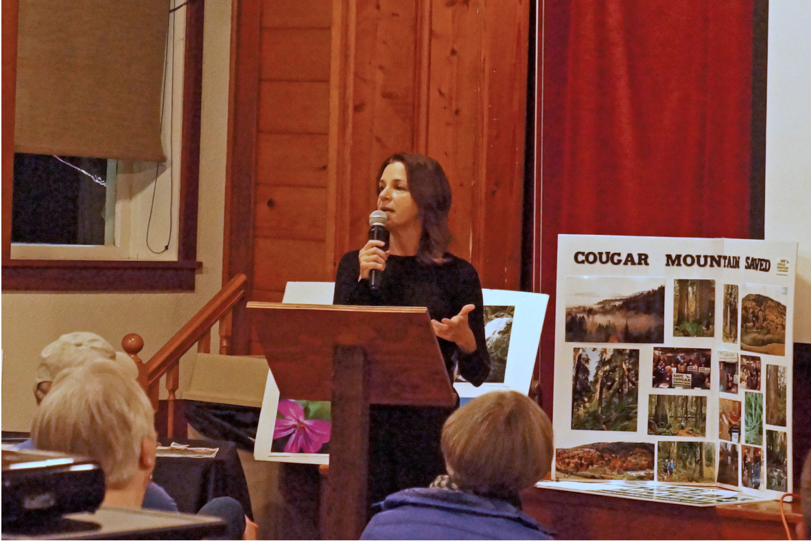
Hilary Franz, Commissioner of Public Lands, delivers the keynote speech.