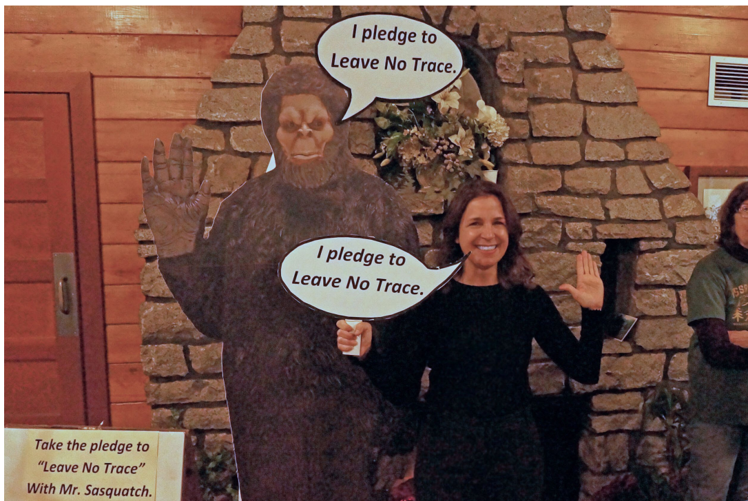
Commissioner of Public Lands Hilary Franz takes the pledge...