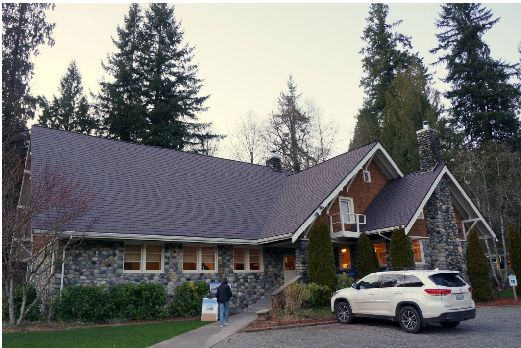
The historic Preston Community Center.