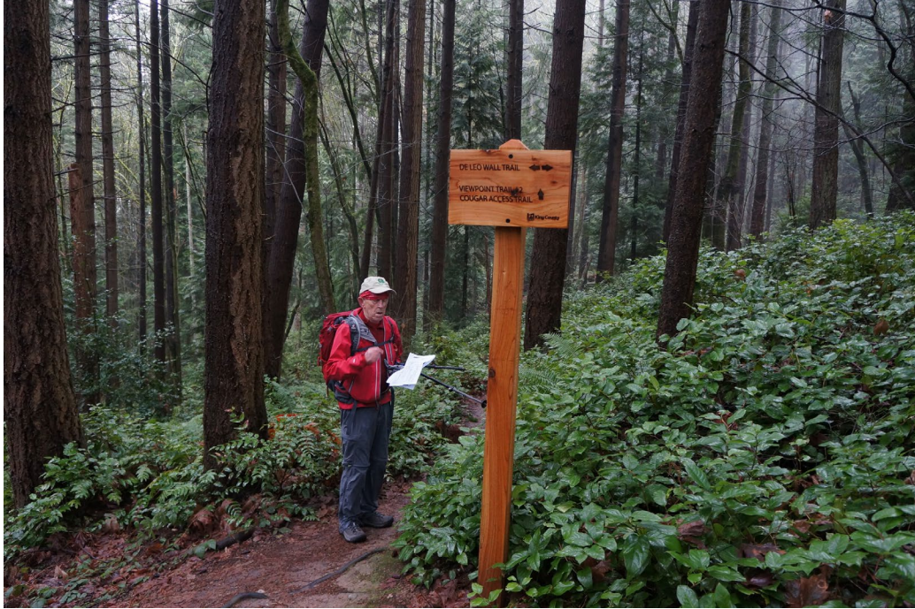
Ralph Owen stands in front of the trail sign for the DeLeo wall trail.