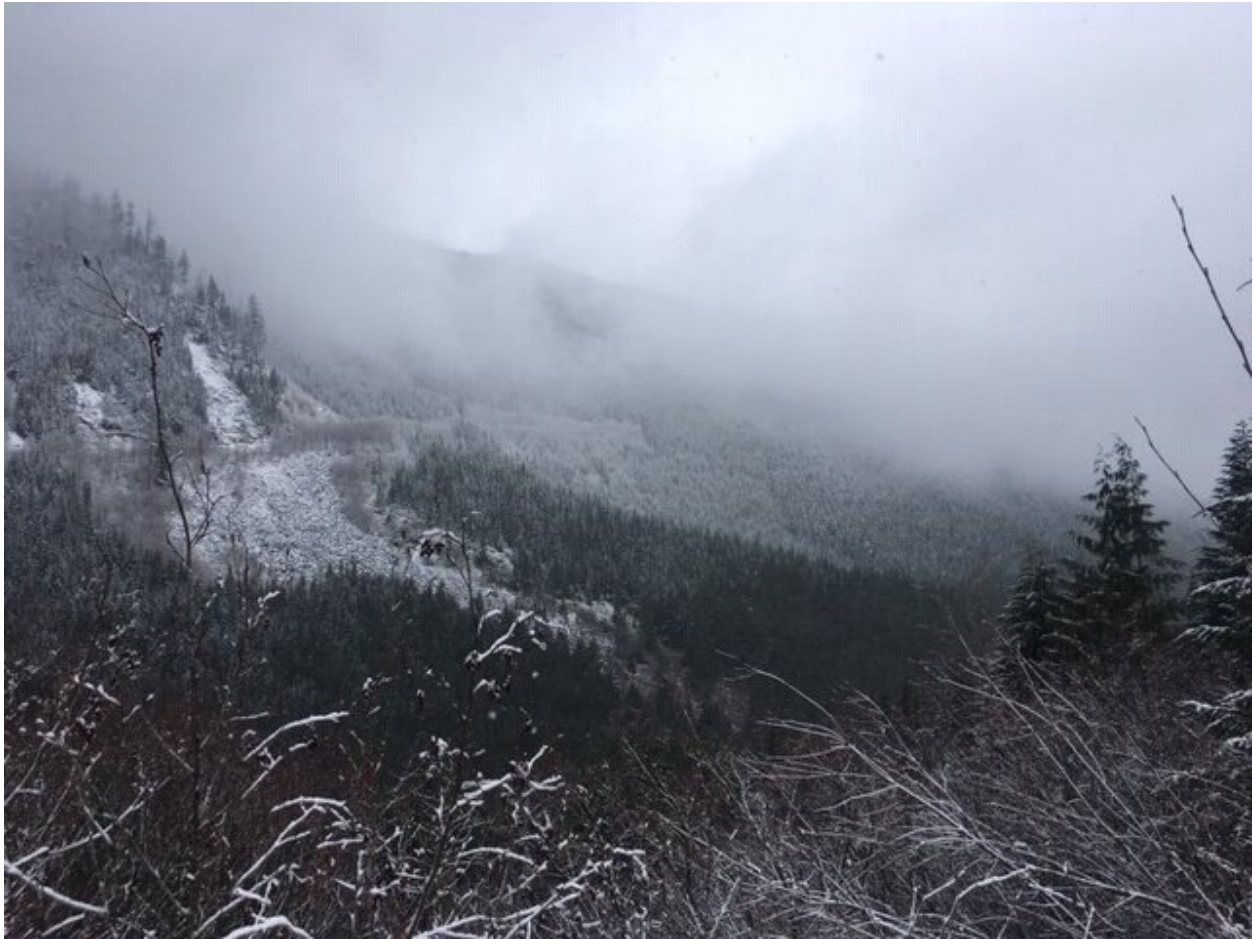
View of the Middle Fork Snoqualmie area from the Granite Lake trail.

The Middle Fork Snoqualmie Road is closed just after milepost 9 due to a landslide. The area received 7 inches of rain in approximately 36 hours, causing instability and eventually a landslide. Crews will assess the damage and determine next steps for repair come spring when the rain subsides for the year. See more information here .