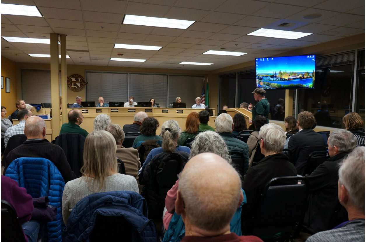
The crowded room.