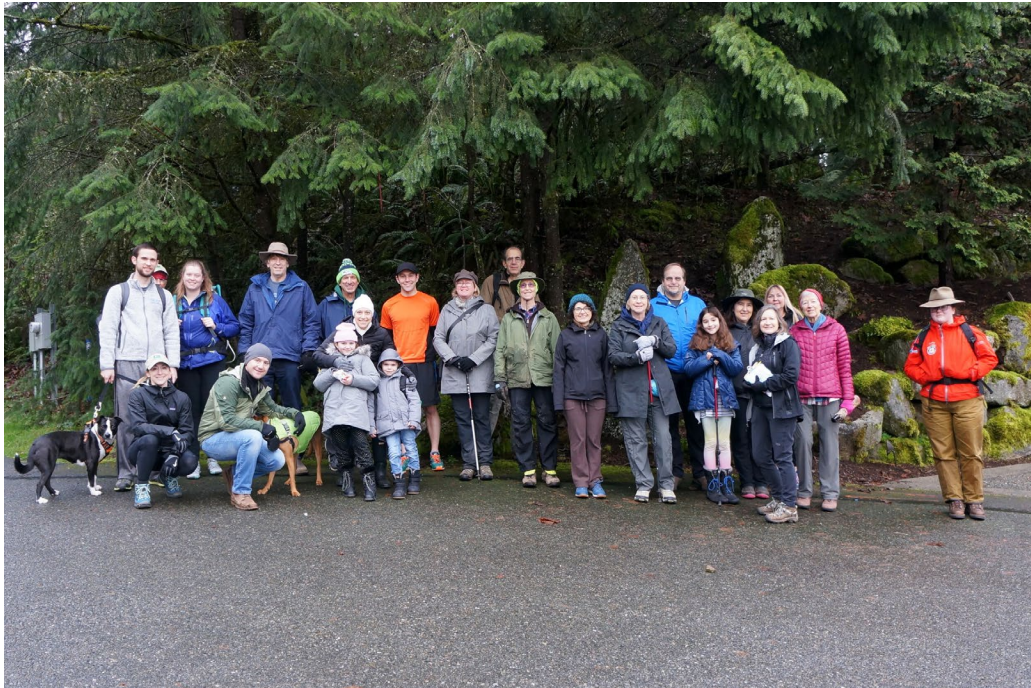
Thanks to all of the hikers who participated in the DeLeo wall hike fundraiser!