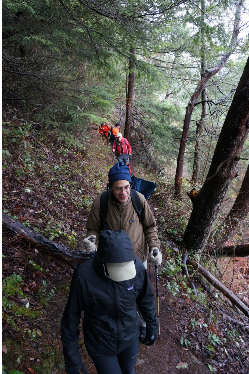
Hikers brave the rain to visit the DeLeo wall property.